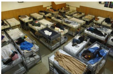
First United Church

Yes, it's still winter, and imagine the challenges for those who don't have a home or the resources to go out and buy the cold weather gear they need. We invite you to look around your closets and drawers and bring in these clean and usable items and leave them in the large wooden box to the right of the ramp that leads into the lower hall at St. David's: