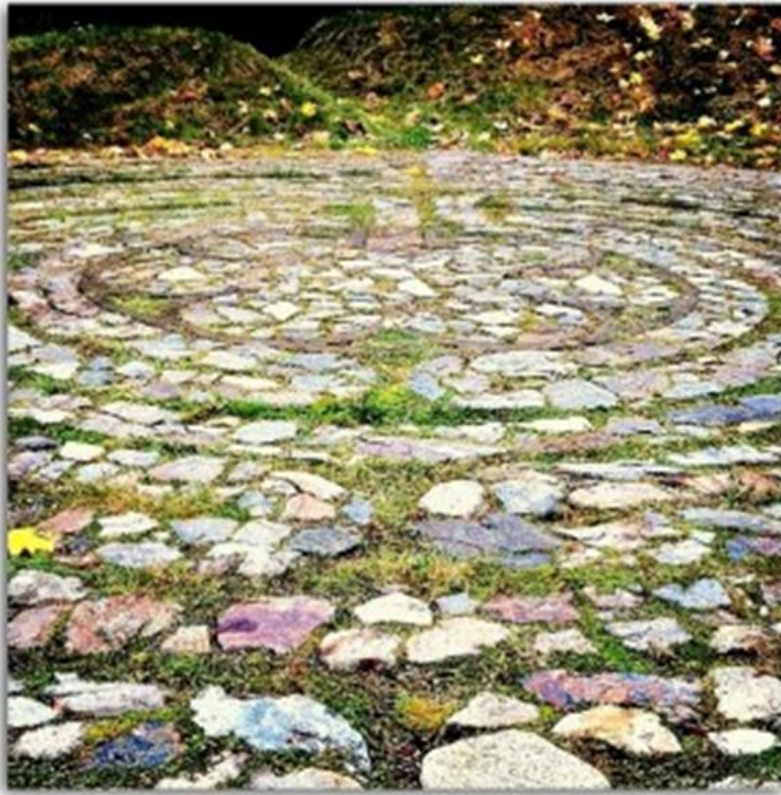
The Labyrinth at Rivendell