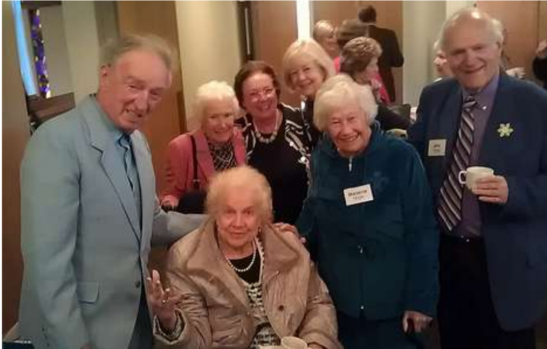
Thank you to St. David's UCW for the St. Patrick's Day Senior's Lunch